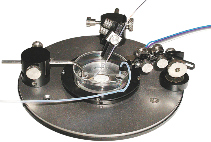
Examples of PDI use inside a microscope heating stage in combination with perfusion

Petri Dish Insert is designed to facilitate solution exchange inside standard culture dishes. This flexible silicone chamber fits most Petri dishes. The insert ships along with self-adhesive gaskets, which form airtight and leak-proof contact with the bottom of the dish, even if the dish is filled with media and if you use plastic dishes with uneven surface on the bottom. This effectively eliminates substance trap and contamination during media exchange. The standard configuration has a laminar cutout to provide fast solution exchange inside the dish without bubbles entering the working volume.